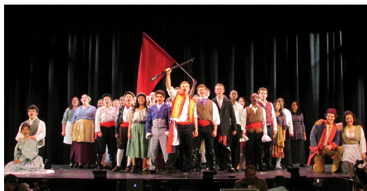
The cast of Notre Dame's Les Misérables .