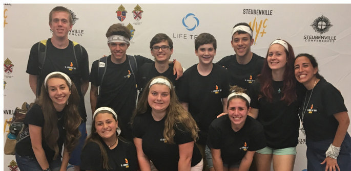
Diocese of Bridgeport High School Apostles program